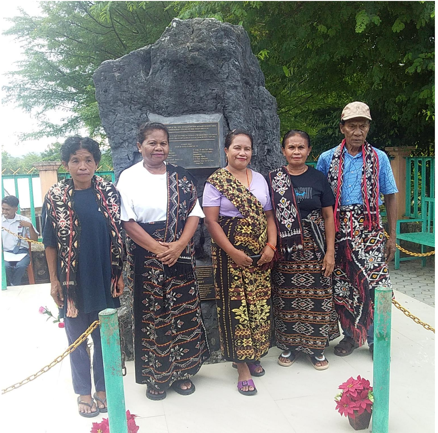
The Kapitan family, on whose land the monument sits, came in traditional attire

In planning this latest ceremony it was decided to involve the local Indonesian community to the greatest extent possible. So, invitations were sent to the local high school, local residents, the owners of the land on which the monument sits, and to national, provincial and local government bodies with responsibilities for cultural preservation, as well as a number of Australians living in Timor. The attendees numbered about 40. The ceremony was conducted in a mixture of Bahasa Indonesia and English. Likewise , the printed information booklet contained both languages.