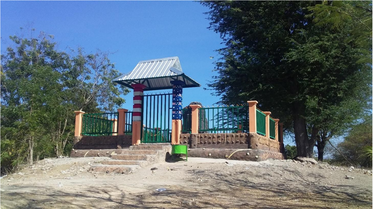
The renovated monument in September 2025

During World War II, Sparrow Force was sent to Timor to defend against Japanese invasion. The 1400 or so men of Sparrow Force came from 14 different units, with approximately 900 men being from the 2 nd /40 th Infantry Battalion, almost all Tasmanians. Retreating from Kupang, they encountered several hundred Japanese paratroopers dug in on Oesau Ridge . There followed an action on February 22, 1942, in which a bayonet charge by the Tasmanians overran the Japanese positions. It is at exactly this location that the Sparrow Force Monument is located in the town of Oesau about 30 km from Kupang City.