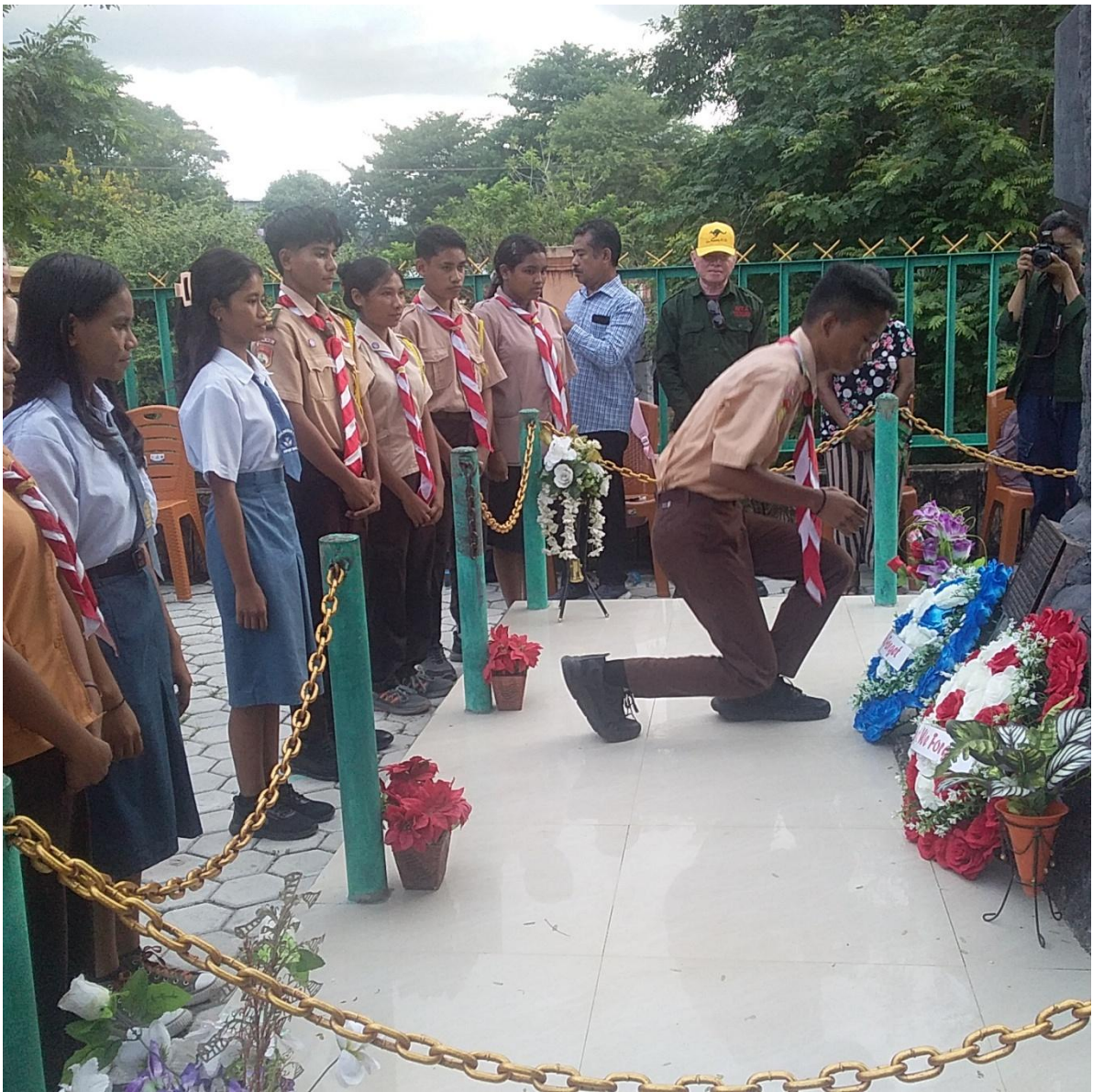
A wreath is placed by Indonesian high school students