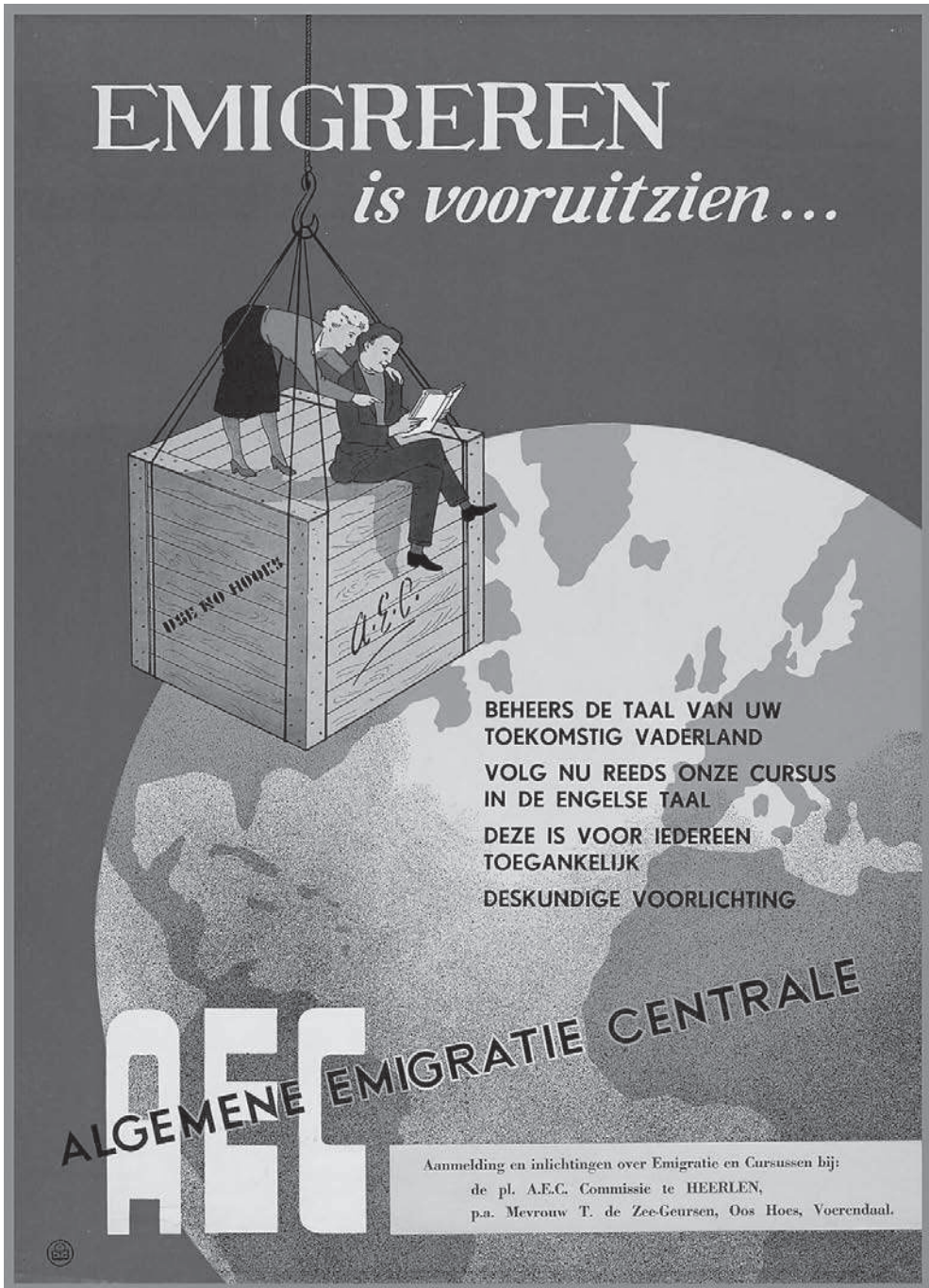
Ill. 1 Poster (1950) made for the General Emigration Centre (Algemene Emigratie Centrale) encouraging people to learn English before they migrate.