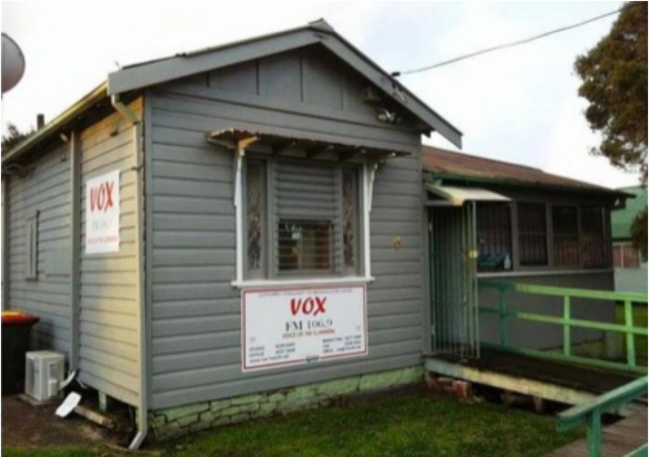
The old VOX FM studio in Ellen Street, Wollongong. (photo courtesy Peter Blom, 2023).