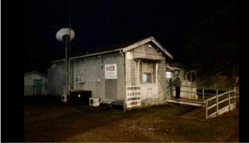
View of the VOX FM studio in Ellen Street, Wollongong at night time (photo courtesy Peter Blom, 2023).

Martin placed an advertisement in the Wollongong Advertiser and recruited Ina and Wim Starmans. It would take over a year before a time slot was made available by VOX FM 106.9 and the only free time slot was on a Sunday night from 11 pm to midnight 3 .