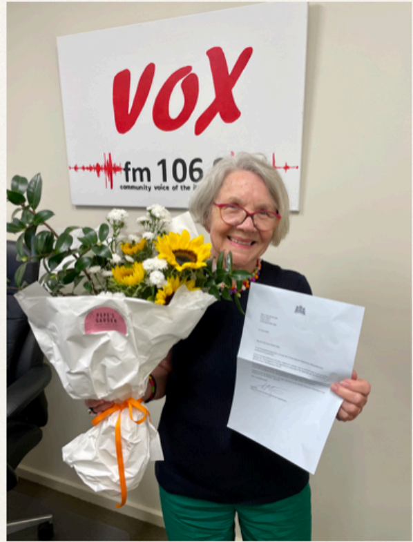
29 March 2023 (photo courtesy Yoke Berry).