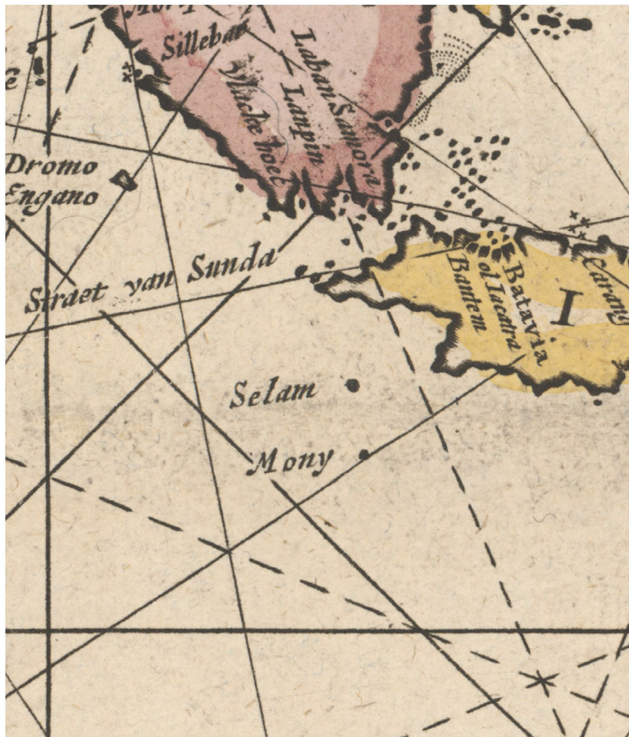
FIGURE 3 Detail from the Pieter Goos map Oost Indien wassende-graade paskaart, vertoonende nevens het Oostelyckste van Africa, meede de zee-kusten van Asia, van C. de Bona Esperanca tot Eso, boven Iapan (Amsterdam, bij Pieter Goos op het Water inde Vergulde Zee Spiegel, seyn nu te bekoomen by Johannes van Keulen (Amsterdam: Johannes van Keulen), National Library of Australia MAP RM 792. http://nla.gov.au/nla.obj-232606621/view

meaning “to copulate”), and schop [sxɔp] (a shovel) are all nativized into Polynesian languages as puha/pusa , tuluma/turuma , pupa , and kope , respectively. The change from the [ɔ] vowel in the Dutch donor words to [u] in the nativized Polynesian words is accounted for thusly: the Dutch /ɔ/ phoneme (spelled with an o ) had, prior to the twentieth century,