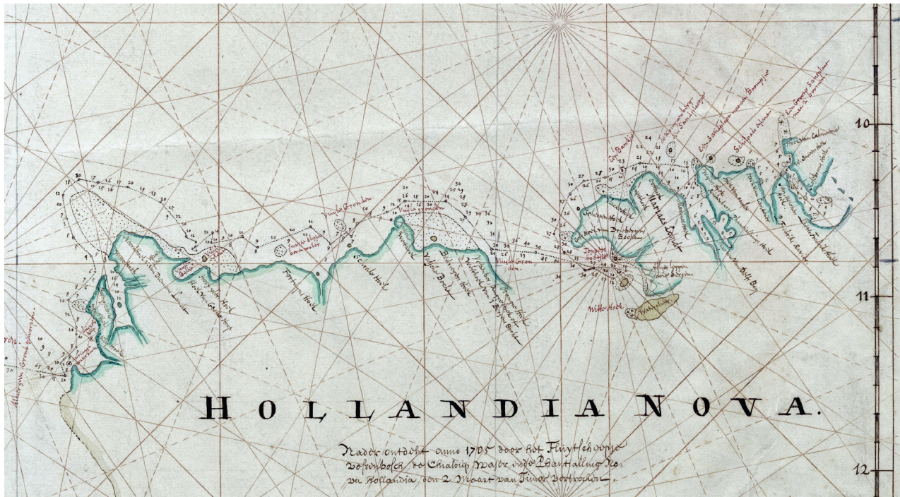
Figure 5. Section of van Delft's 1705 manuscript chart showing the names he bestowed on the north coasts of Melville Island and Cobourg Peninsula (Anon. 1705. Kaart van Hollandia - Nova, nader ontdekt, Anno 1705, door het fluitschip Vossenbosch, de chialoup Wajer en de Phantalling Nova-Hollandia, den 2 Maart van Timor vertrocken. (Nationaal Archief, Den Haag, Verzameling Buitenlandse Kaarten Leupe, 4.VEL, inv. nr. 500. Online at www.nationaalarchief.nl/onderzoeken/archief/4.VEL/inventaris?inventarisnr=500 )

Given van Delft's journal is no longer extant, and the publication of the 1705 manuscript chart of his voyage did not occur until nearly a decade after van Dijk's book was published (and a year after van Dijk's own untimely death), it is not surprising van Dijk did not know of van Delft's toponyms' locations. Van Dijk did however have access to the written report by Swaardecroon and Chastelijn (Councillors of the VOC in Batavia) of 6 October 1705, providing a summary of van Delft's voyage and discoveries, and actually cites it (see: van Dijk 1859, §7:47-52; Swaardecroon & Chastelijn 1856 [1705]; Major 1859:165-173; Robert 1973:138-145). This report, compiled from the written journals and verbal narratives of the returned officers, provides the names bestowed upon 17 locations. It is clear van Dijk obtained the 12 names on his map from this report. 22