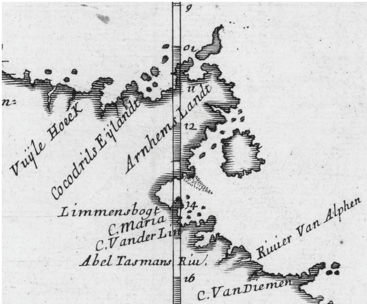
Figure 3. Thevenot, M. [1663]. Hollandia Nova detecta 1644; Terre Australe decouverte l'an 1644. (detail) [De l'imprimerie de Jaques Langlois, Paris].

In the meantime, Carstenszoon continued his return journey back up the coast of Cape York Peninsula in order to more accurately chart it, bestowing various names along the way. These were recorded on a chart drawn by Arent Martenszoon de Leeuw, the upper-steersman (first mate) of the Pera (Fig. 4). After a five month voyage, they anchored in Ambon on 8 June.