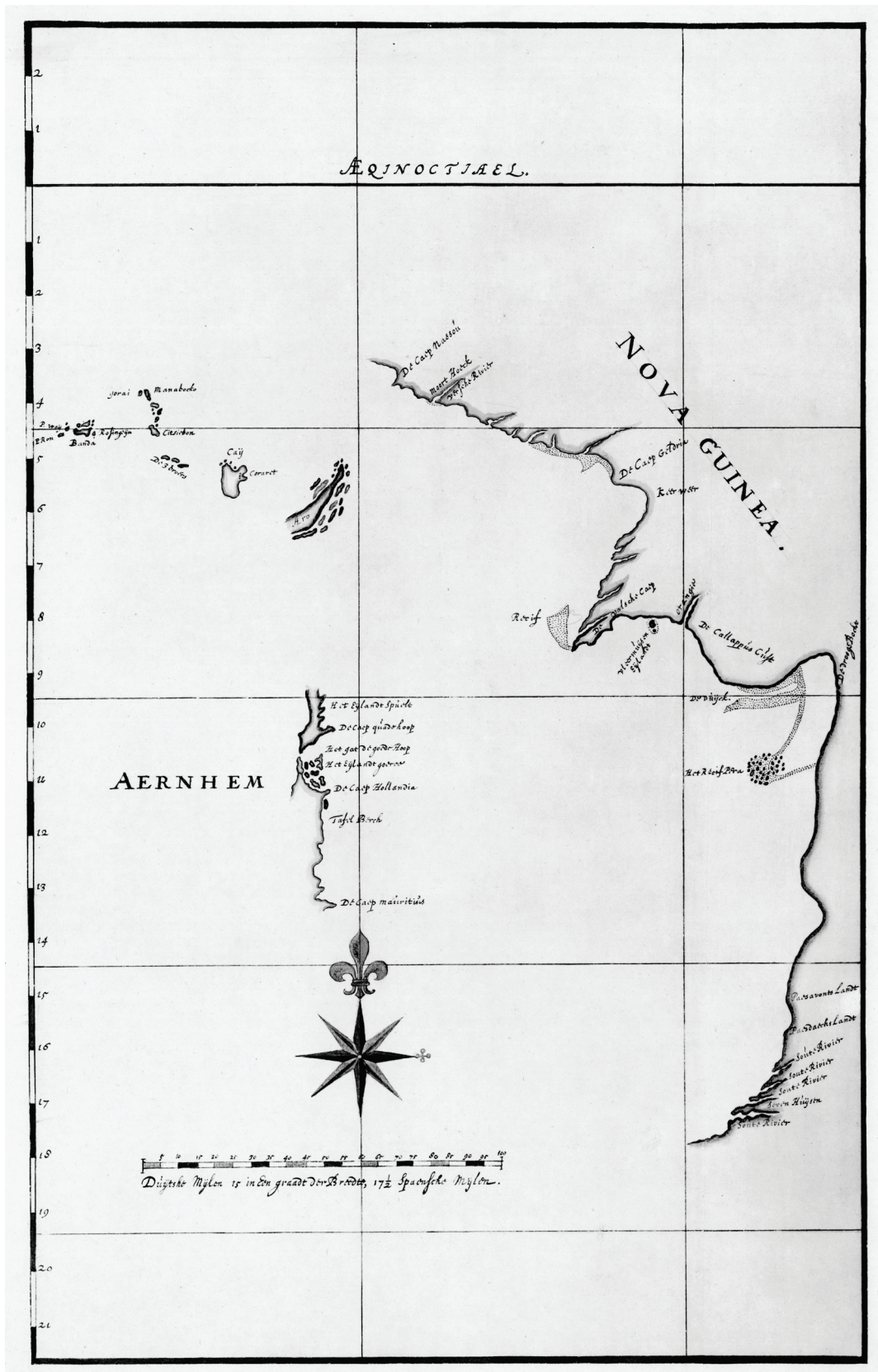
Figure 2. Anon. (1670). The discovery of Arnhemland, Australia, by the Yacht Arnhem, 1623 – from the secret atlas of the East India Company, c. 1670. Martinus Nijhoff, The Hague [1925-33].