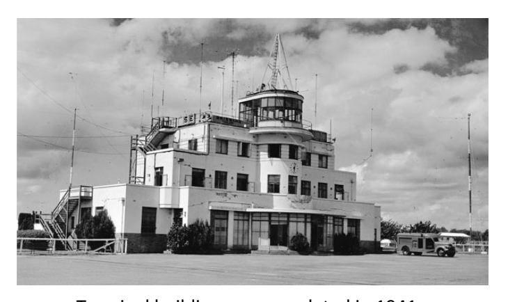
Terminal building was completed in 1941.