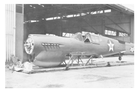
Uncrating aircraft AC-5336 of 49th Fighter Group at Archerfield in early 1942.

A number of crated USAAF aircraft were assembled at Archerfield in the early part of 1942.