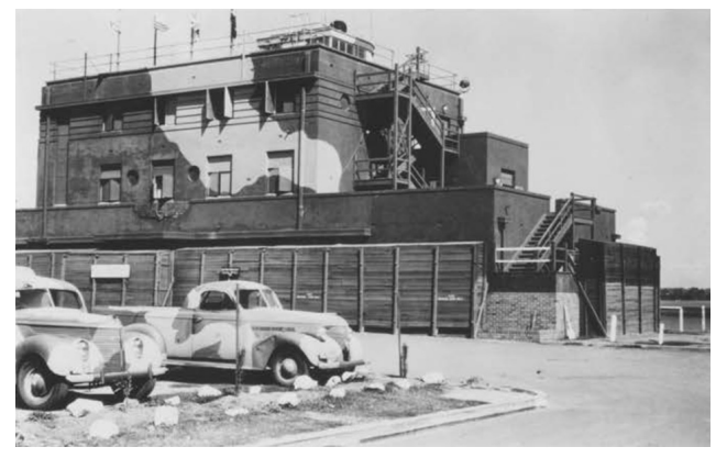
Note the camouflage and splinter proof walls on the Terminal building in Aug 1943.

The following military units occupied Archerfield during WWII:-