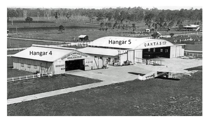
Hangar 5 was first Hangar built at Archerfield in 1930 & became Qantas's Hangar No. 2

Hangar 1, the Government hangar from Eagle Farm moved here in April 1931. Hangar 4, the Qantas hangar from Eagle Farm moved here in June 1931 & was demolished in Feb 2021.