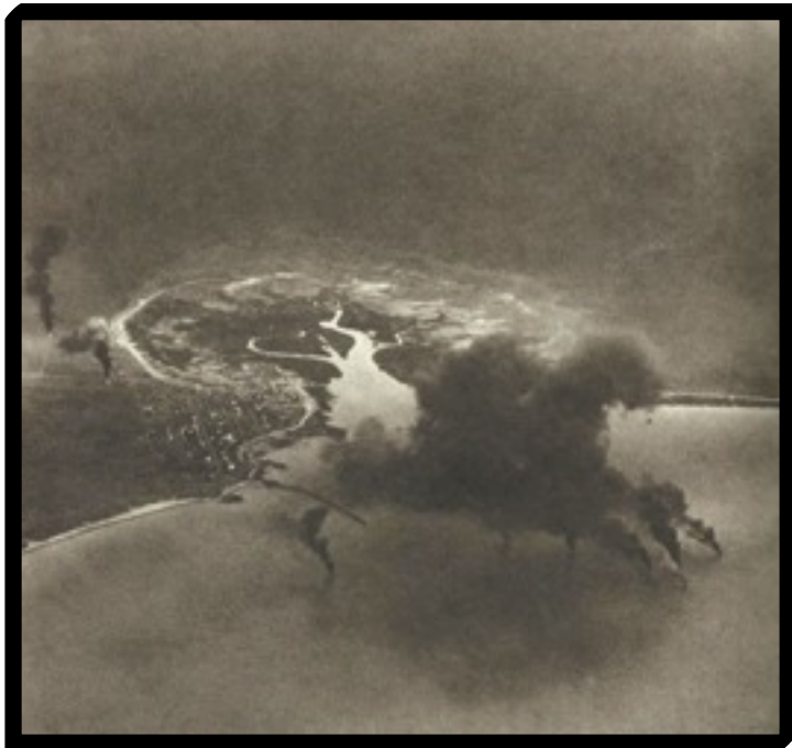
View of Broome and Roebuck Bay showing the aftermath of the air raid, taken by the 'Babs' (After Ashai Shimbun n.d. via Willy Piers 2005).