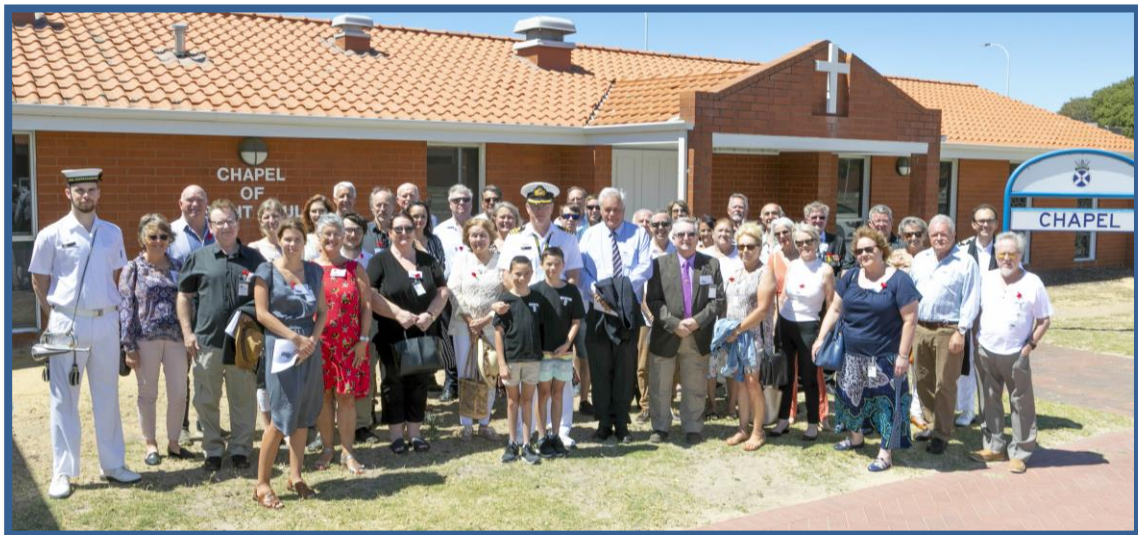
Participants of the HMAS Armidale Day Service, at HMAS Stirling Chapel, Garden Island on the 1 st of December 2019.

The day started with approximately 40 guests arriving at 1pm at HMAS Stirling Pass Office at the entrance to Garden Island Western Australia after receiving a positive response to initial expressions of interest for this, the inaugural Remembering HMAS Armidale service.