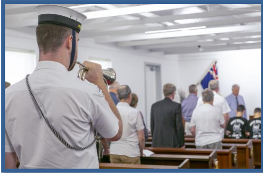
The Bugler during the Minute Silence, HMAS Armidale Day at HMAS Stirling Chapel.

After the service, guests walked to the HMAS Stirling Museum and were able to view the different historical items on display before making their way to Sir James Stirling Mess. The Mess overlooks Cockburn sound which is a view not many people outside the Navy get to see.