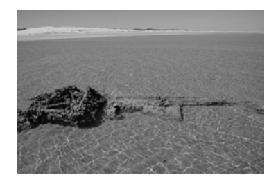
Figure 4 The wing of the Dakota.

bronzed beachcomber empties it out on his desk. Palmer tells Gibson that he found the package in the water near Carnot Bay. <sup>12</sup>According to Palmer the package fell apart as he picked it up and most of the diamonds were lost in the surf. What he has emptied on the Major's desk is what he was able to salvage, he claims. For his honesty, Palmer is appointed as a coast watcher at Gantheaume Point.