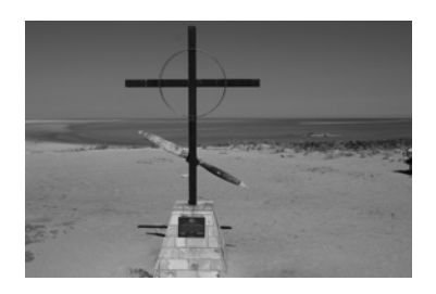
Figure 5 The new memorial at Smirnoff Beach opened by the Dutch Ambassador in 2013.