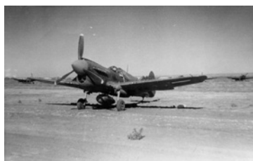
Figure 3 Kittyhawk of No. 120 NEI Squadron, Potshot, March 1944 (Photo. No. P920782, Charles Eaton Collection).