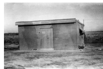
Figure 6 No. 79 Wing HQ at Potshot, March 1944 (Photo. No. P920774, Charles Eaton Collection).