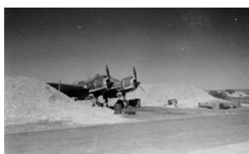
Figure 4 Beaufighter of No 31 Squadron at Potshot March 1944 (Photo. No. P920783, Charles Eaton Collection).

Once the squadrons and their support staff were established in Potshot, Eaton immediately drew up an elaborate network of defences for the Wing's temporary base. Perhaps his experiences as a Lance-Corporal in the trenches on the Western Front in 1915 and defending Vimy Ridge a year later, helped form his defence planning, as his trench layout and machine gun deployment strategies were purely 'army'. Eaton's defence orders were outlined as: